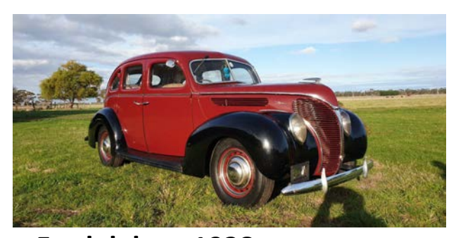
Ford deluxe 1938

Sidevalve v8 ,good condition has been on club rego .$32000 Currently in Melbourne Call John on 0428387499