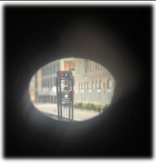
A 1920's traffic light – New York City. A bronze traffic signal tower designed by Joseph H. Freedlander on the corner of 42nd Street and Fifth Avenue, 1922.